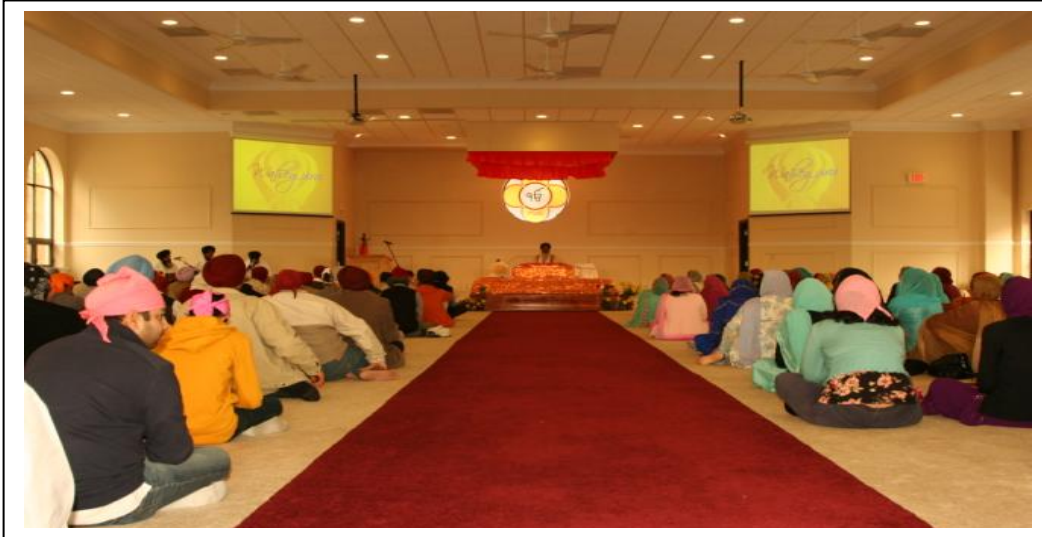
Our Darbar Hall

Please know that 2011 was a tough year since there were no elections at GSSA in last 10 years or so. Coming in an restoring Sangat's trust was a big challenge. As a Working Committee we had two choices (1) Look back, harp upon the past and stifle our progress (2) Follow “together we must move” model and work towards the betterment of GSSA's future. We opted for the second model, moved forward and took these positive steps.