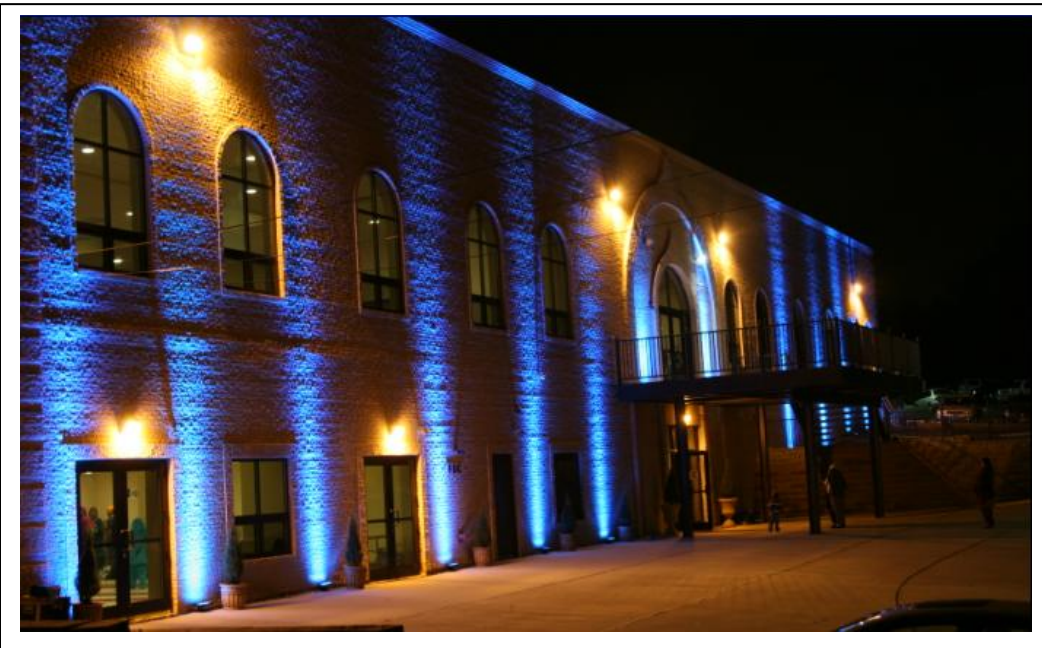
Special Decoration by Sangat members on Vaisakhi